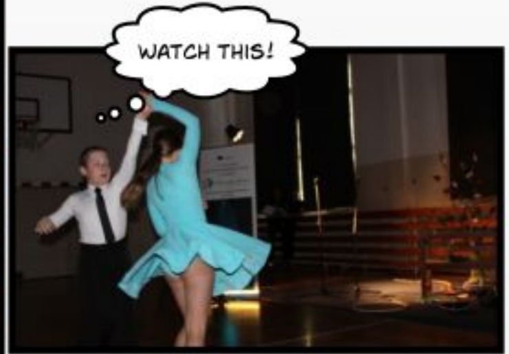
THERE WAS SOME PORTION OF DRAMA, MODERN DANCE, SAMBA, PLAYING THE GUITAR AND SINGING...EH..