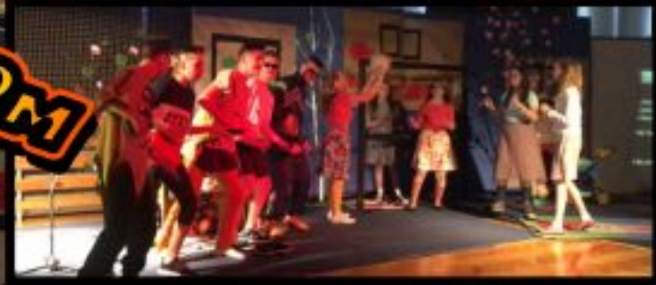
WITH A GREAT APPLAUSE