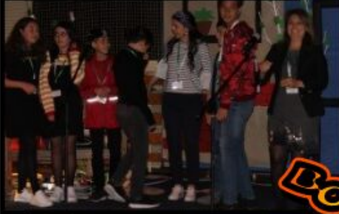
THEN GUESTS INTRODUCED THEMSELVES